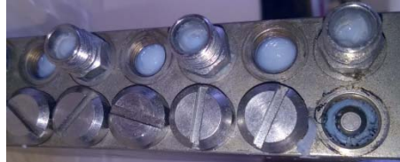
Fig. 2: Progressive distributor before dismantling

The specialists at Chemie-Technik responded quickly with a new development: The polyurea-thickened silicone oil ELKALUB GLS 762/N0 does not require polytetrafluoroethylene and is equipped with a so-called NSF H1 registration for the food sector. The grease of NLGI class 0 was produced in a very short time as a sample, the expensive distributor was cleaned and repaired by the responsible customer advisor and the central lubrication system of the filler carousel was put into operation again.